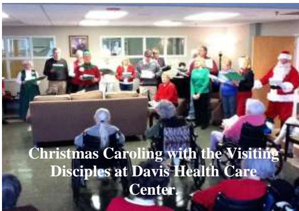
Christmas Caroling with the Visiting Disciples at Davis Health Care Center